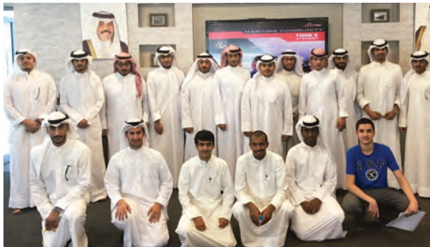
■ Group photos

Fleet Personnel Group, in cooperation with Kuwait Oil Company (KOC), held an awareness presentation for the students who successfully enrolled in the Marine Scholarship Program (2017/2018) to explain the necessary steps and procedures to be taken to complete the Scholarship program. The presentation was held on April 5th, 2018 at KOTC Auditorium and