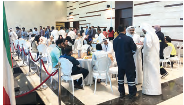
■ Side of Attendance