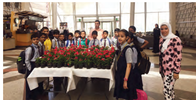
■ Side of events

Kuwait Institute for Scientific Research, KPC, EPA, Palm Friends Society and many parties.