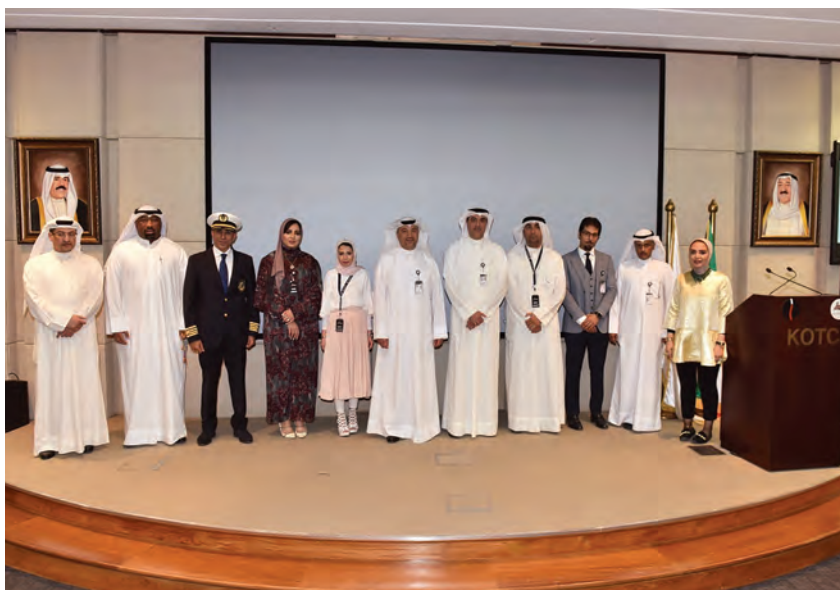
■ Photo Group