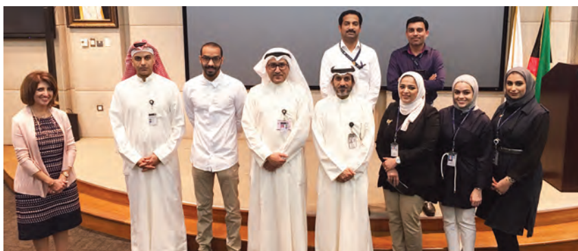
■ The Team from KOTC and KOC

Towards the end of the presentation, copies of code of conduct and the contracts were distributed to students and their parents to be signed, and the Marine Scholarship contract was signed by students and parents.