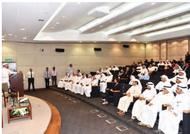
■ Part of the attendance