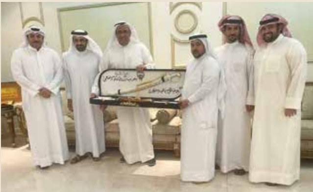
■ A side of the honoring