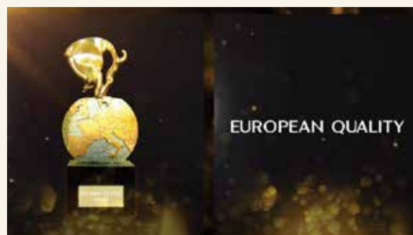
■ Forum logo

KOTC was awarded the "European International Quality Award" during the "Achievements Forum 2021" held in the UK, on June 25, 2021. It is awarded to leading international companies for their aspirations to achieve high-quality work and services according to the European standards. This award is a new addition to the series of awards received by the Company thanks to the efforts of its top officials and employees, and their constant interest in placing the Company among the international companies.