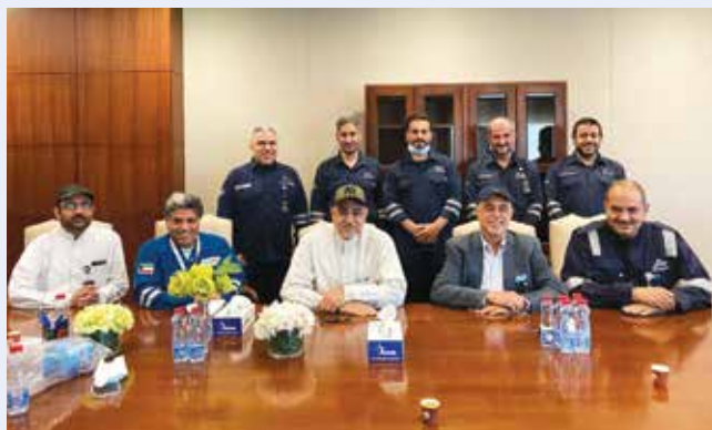
■ A memorial shot of the visit shows the Board of Directors' members and the Company's top officials within the plant

Out of the concern about following up the workflow at all the Company's facilities, KOTC's Board of Directors and top officials paid an oversight visit to Umm Al-Aish Gas Filling Plant, in which they viewed the plant's production process. The Board of Directors' members praised the efficiency of the work of all the plant's staff and their concern for sterilizing and cleaning gas cylinders prior to delivering them to the distribution branches in all areas. They commended the staff adhering to the precautionary measures approved by the Ministry of Health since the beginning of the COVID-19 outbreak.