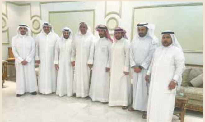
■ group picture